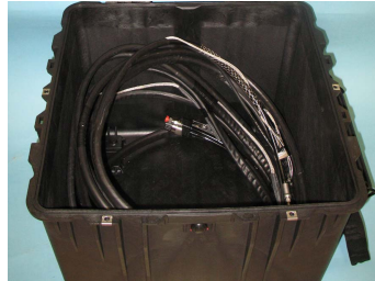
High Pressure Hose