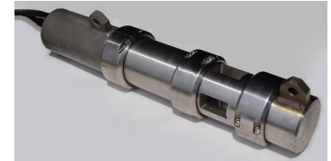
Air Gun Close up